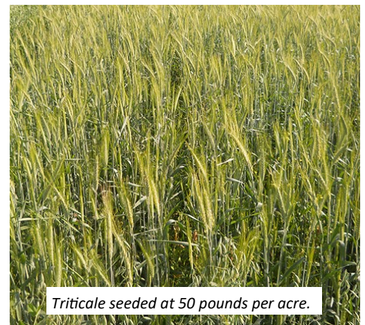
Triticale seeded at 50 pounds per acre.