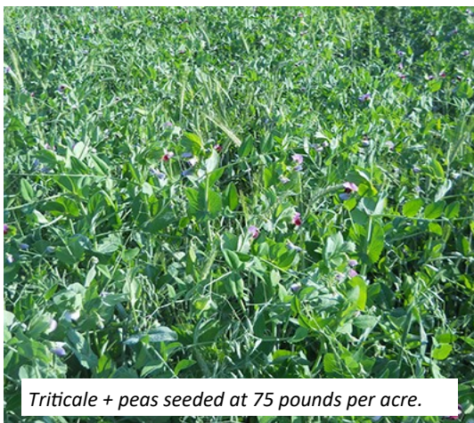
Triticale + peas seeded at 75 pounds per acre.

Alfalfa stand results from this project will be published on the MSU Extension News for Forages website in spring 2019. Please contact Jim Isleib, Extension Educator, at isleibj@anr.msu.edu with any questions.